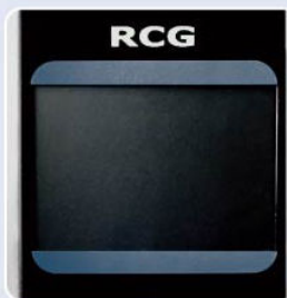
3.5" TFT colour LCD